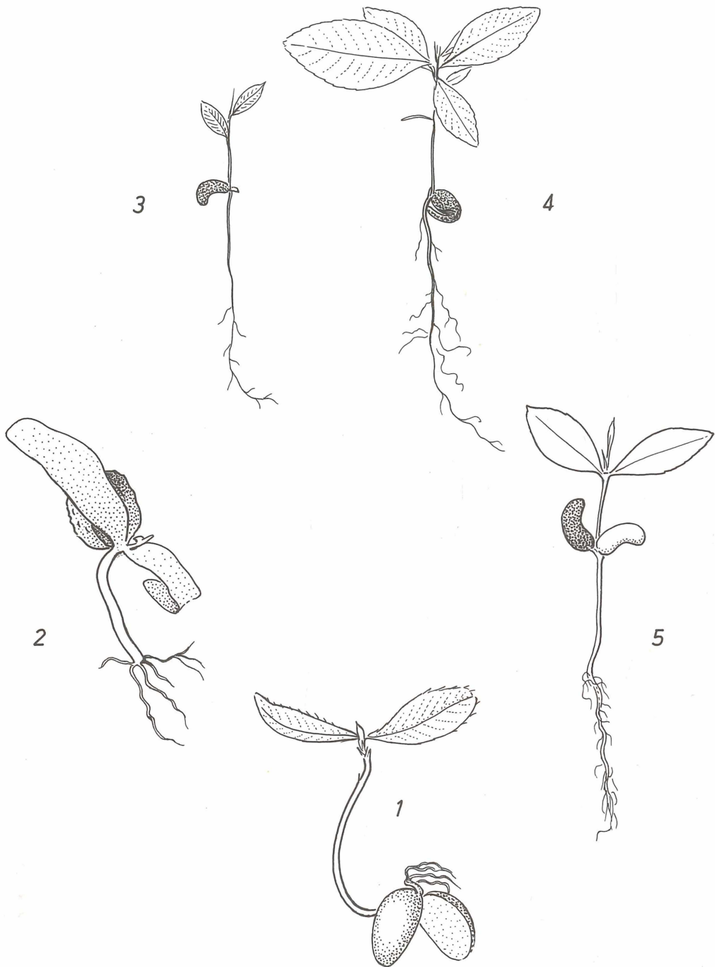
Table II Explanation in text